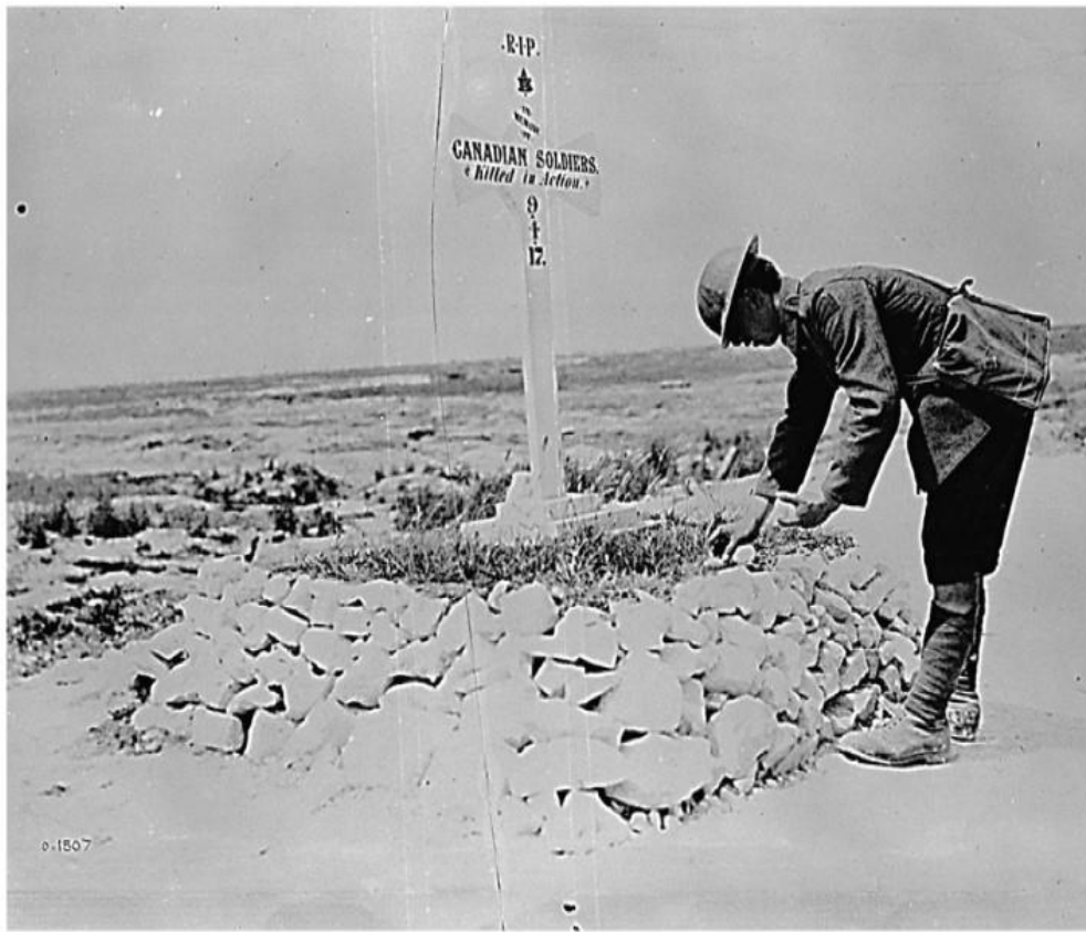
A First World War soldier places stones on a Canadian grave near Vimy, France on June, 1917