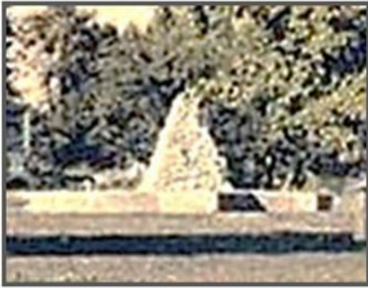
The 1919 Fieldstone Cairn Monument to Honour the WWI Residents of Brighton who paid the Ultimate Sacrifice

To You From Failing Hands, We Throw the Torch